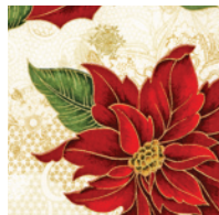
APTM-9159-91 Crimson 3/4 yard