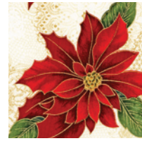
APTM-9159-91 Crimson 1-1/2 yards