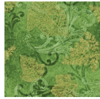
APTM-9166-224 Evergreen 1-1/2 yards