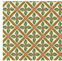
APTM-9163-200 Vintage 1/2 yard