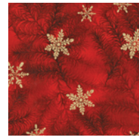
APTM-9167-91 Crimson 1-1/4 yards