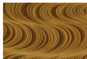
ESJ-6771-176 Bronze Coordinating Fusions™