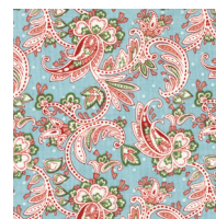
AKC-7945-200 Vintage 1 yard