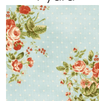
AKC-7948-200 Vintage 1 1/4 yards