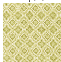
AKC-7952-200 Vintage 2 1/2 yards