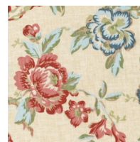
AKC-7947-200 Vintage 1 yard