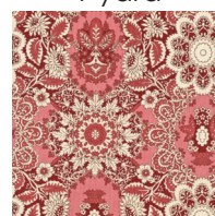
AKC-7946-200 Vintage 1/2 yard