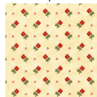
AKC-7953-200 Vintage 1 yard