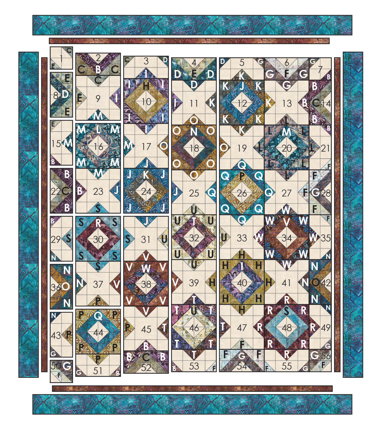
Step 8: Sew the side inner borders to the sides of the quilt center. Press toward the borders. Sew the top and bottom inner borders to the quilt center. Press toward the borders.

Step 9: Sew the side outer borders to the sides of the quilt center. Press toward the borders. Sew the top and bottom outer borders to the quilt center. Press toward the borders.