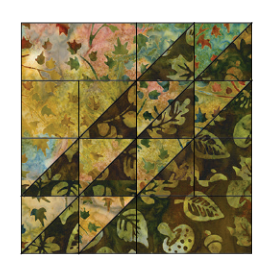
nine H/E Blocks