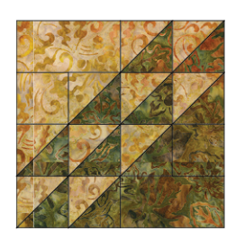
ten D/I Blocks