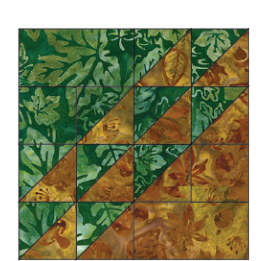
ten G/A Blocks