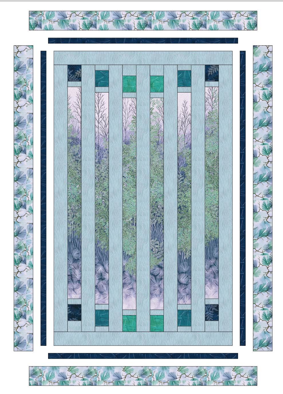
Step 9: Sew the side inner borders to the sides of the quilt center. Press toward the borders. Sew the top and bottom inner borders to the quilt center. Press toward the borders.

Step 10: Sew the side outer borders to the sides of the quilt center. Press toward the borders. Sew the top and bottom outer borders to the quilt center. Press toward the borders.