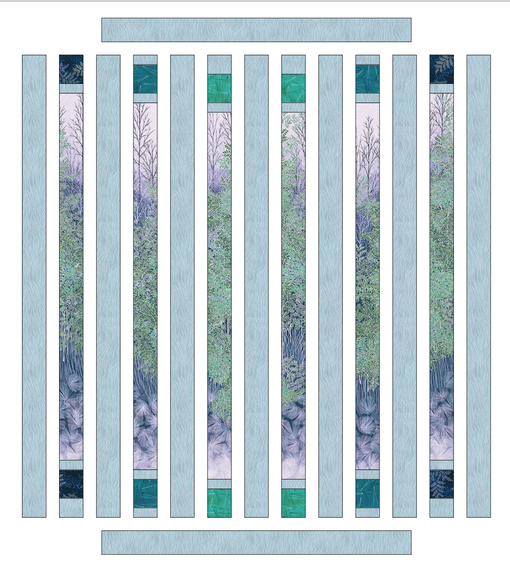
Step 7: Sew Columns 1-6 together along the longest edge, placing a 3" x 49" Fabric B strip between each column. Sew a Fabric B strip to the left and right edges of the unit, too. Press all seams toward the Fabric B strips.

Step 8: Sew a 3" x 33" Fabric B strip to the top and bottom edges of the unit. Press the seams toward the Fabric B strips.