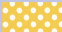
ADZ 5609-4 Screaming Yellow