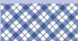
ADZ 5605-6 Blue Jay