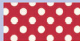
ADZ 5609-1 Lipstick