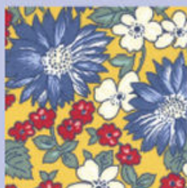
ADZ 5604-3 Blue Jay