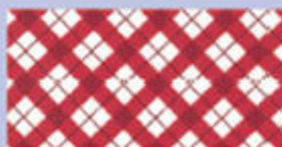
ADZ 5605-3 Lipstick