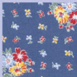
ADZ 5606-1 Evening