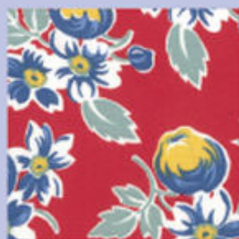
ADZ 5603-4 Lipstick