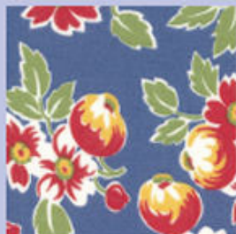
ADZ 5603-1 Blue Jay