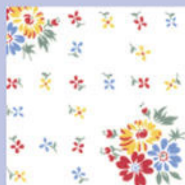
ADZ 5606-2 Vintage White