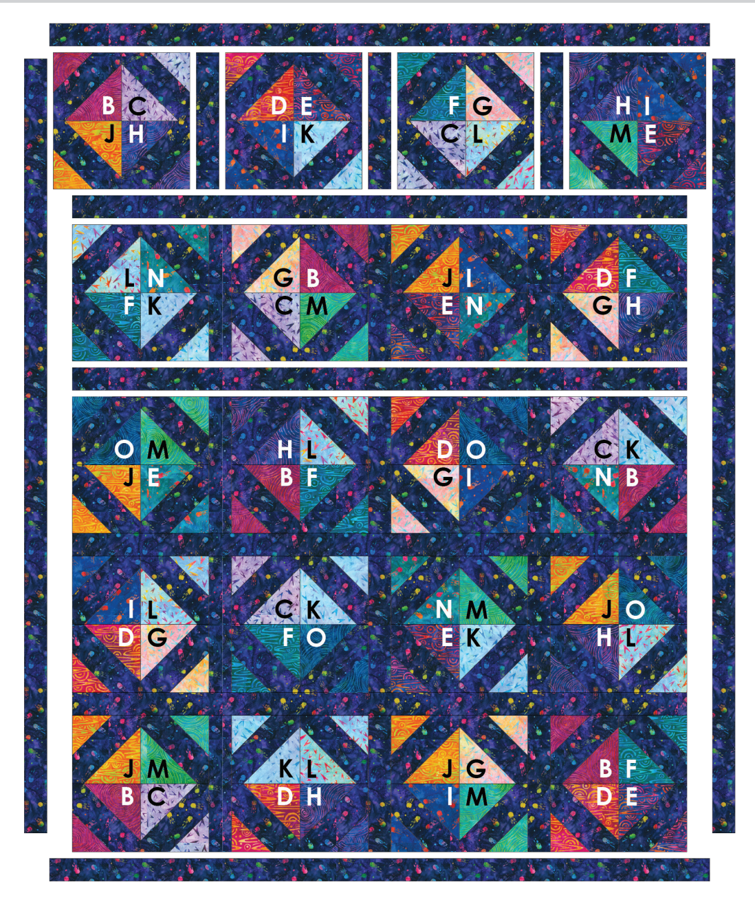
Step 4: Arrange the Blocks together as indicated in the Quilt Assembly Diagram. Sew each row together, using sashing strips between each block. Press seams toward the sashing. Repeat to make five block rows.

Step 5: Sew the sashing and block rows together, pinning and nesting the seams. Press seams open or to the sashing.