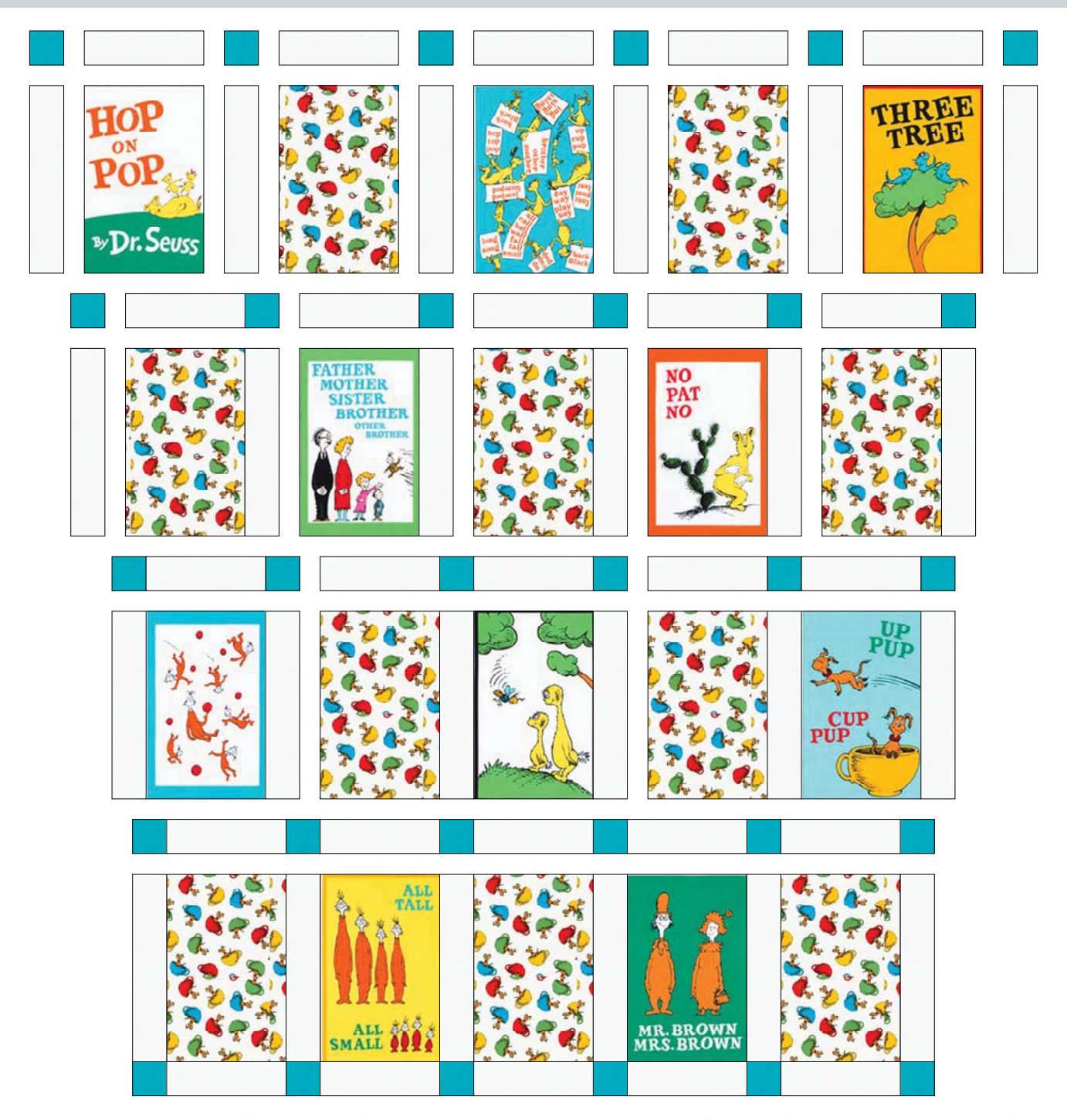
Step 1 : Arrange the Fabric A and B rectangles together as indicated in the Quilt Assembly Diagram. Sew each row together, using 2-1/2" x 11-1/2" sashing strips between each block and at the beginning and end of each row. Press seams toward the sashing. Repeat to make four block rows.

Step 2: Gather six cornerstone squares and five 2-1/2" x 7-1/2" sashing strips. Sew each row together, using cornerstones between each sashing strip and at the beginning and end of each row. Press seams toward the sashing. Repeat to make five sashing rows.