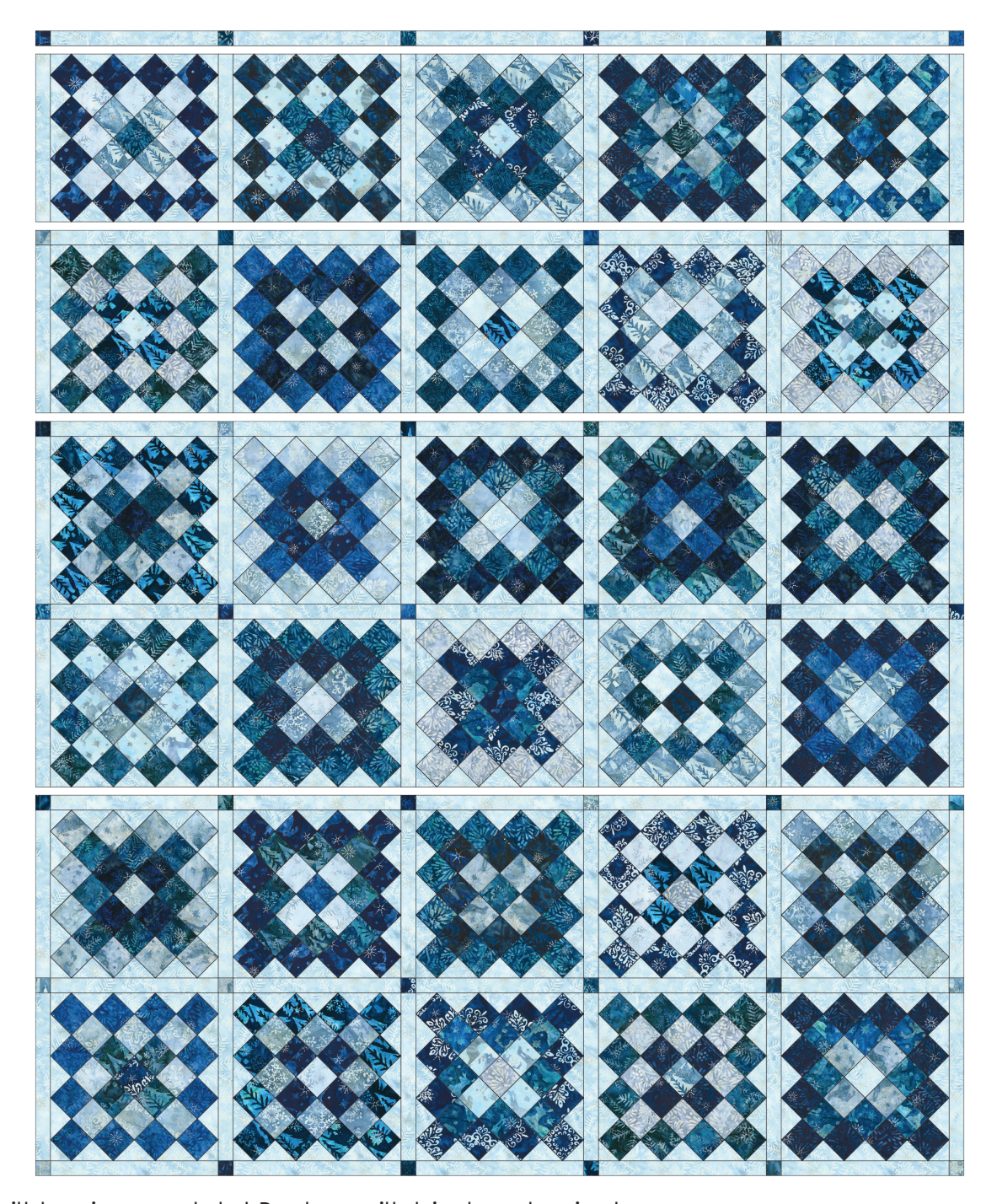
Step 5 Join the block rows and the horizontal sashing rows, matching and pinning seam intersections. Press all the seams towards the sashing rows.

Your quilt top is complete! Baste, quilt, bind and enjoy!