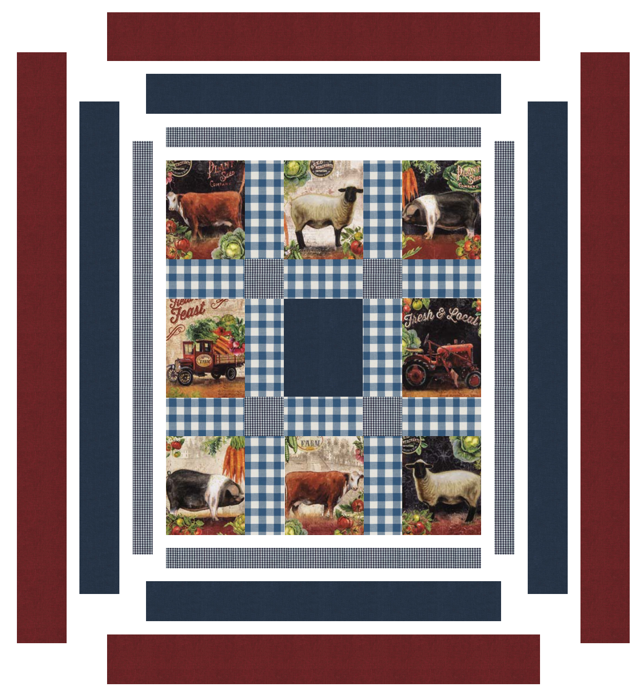
Step 4: Sew the Fabric D top and bottom inner borders to the quilt center. Press toward the borders. Sew the Fabric D side inner borders to the sides of the quilt center. Press toward the borders.

Step 5 : Sew the Fabric B top and bottom middle borders to the quilt center. Press toward the borders. Sew the Fabric B side middle borders to the sides of the quilt center. Press toward the borders.