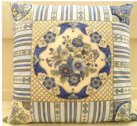
Cushion 17" x 17"

Show off your Dutch inspired fabrics in this easy to piece runner and then complete the picture with a Dutch plate cushion, using your left over fabrics!