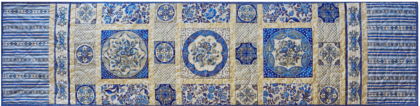
Runner 67" x 19'