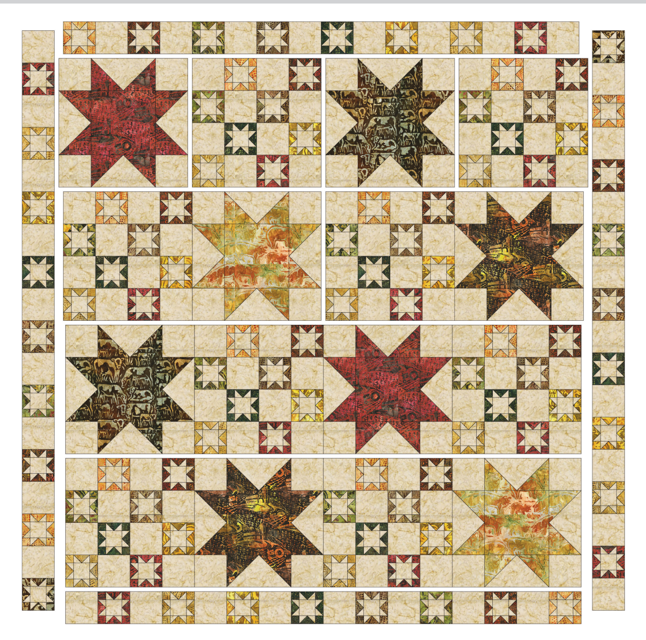
Step 17: Arrange the Large Star Blocks and Grid Blocks into four rows of four blocks. Note the fabric placement and block orientation in the Quilt Assembly Diagram.

Step 18: Sew the blocks together to form rows. Press the rows to the left in the even numbered rows and to the right in the odd numbered rows.