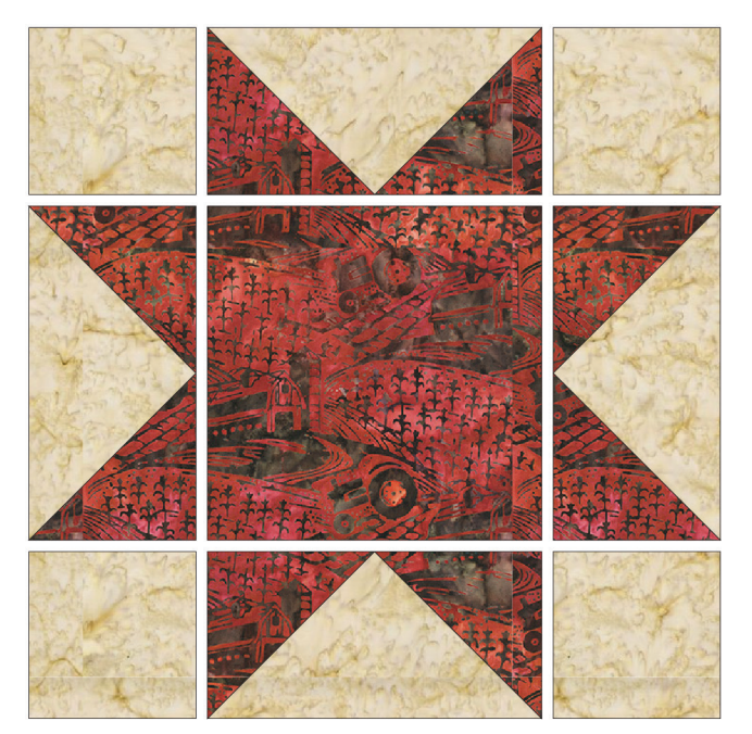
Step 5: Gather: four 4-1/2" Fabric A squares four Large Flying Geese from Fabric B one 8-1/2" Fabric B square

Arrange the units into three rows of three. Note the fabric placement and block orientation in the Block Assembly Diagram.