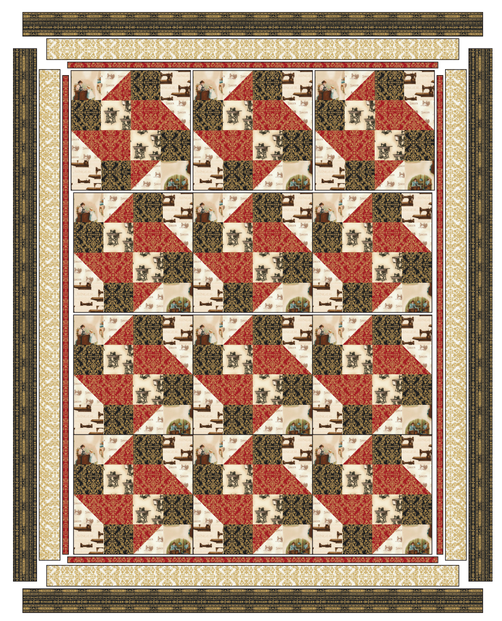
Quilt Assembly Diagram