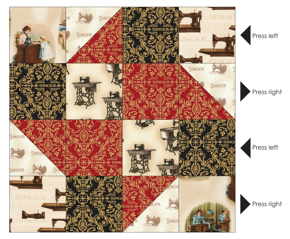
Block Assembly Diagram