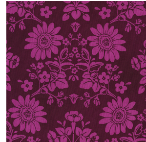
EVK-6878-24 Plum 2 yards

View B shown here. Fabric requirements listed are for size S. See chart below for alternate size requirements.