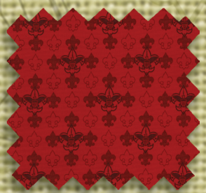
ABT-9141-3 RED 1/4 yard