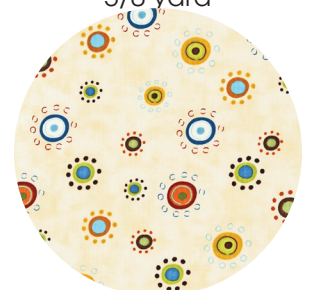
AQK-7816-169 Earth 3/8 yard

Instructions included for boy & girl colorstories as well