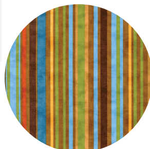
AQK-7818-169 Earth 1/2 yard