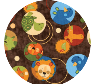
AQK-7815-169 Earth 3/8 yard