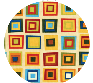
AQK-7811-169 Earth 1/4 yard