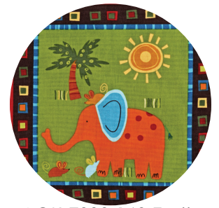
AQK-7809-169 Earth 1 yard