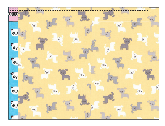
Edges of fabrics not shown aligned in the illustration to depict layers.

Step 3: Repeat the process, placing the remaining exterior piece right side up on the work surface. Place the completed Step 2 unit exterior (Fabric A) side down, aligning the zipper with the top edge of the fabric. Baste in place with a 1/8" seam. Place the remaining lining (Fabric C) piece right side down. Sew along the top of the unit. Position the fabrics wrong sides together and press the seams away from the zipper. Topstitch along the fabric near the zipper.