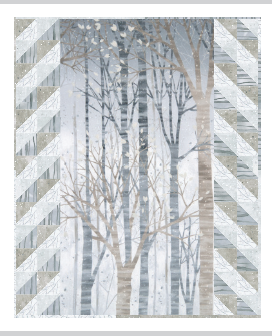
Fabric and Supplies Needed

Fabric amounts based on yardage that is 40" wide.