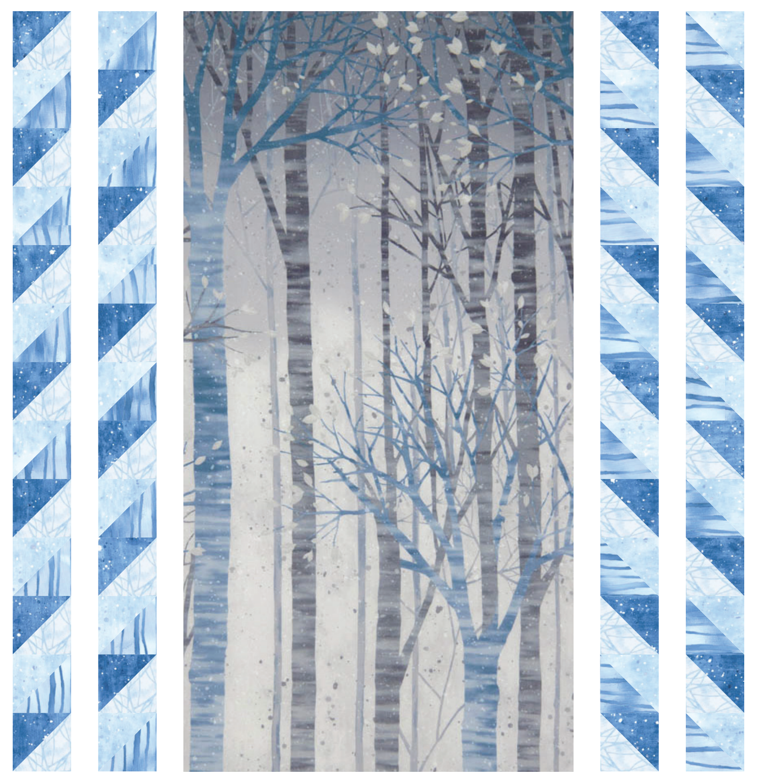
Step 4: Sew the columns and quilt panel together, nesting the seams in the HST columns. Press the column seams open.

Your quilt top is now complete. Baste, quilt, bind and enjoy!