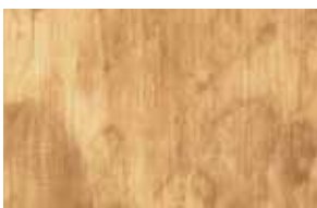
Kona Multi Dye EDD2459-11 GOLD