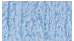
D036-68 LUNAR BLUE