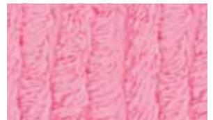
D036-67 LIPSTICK PINK