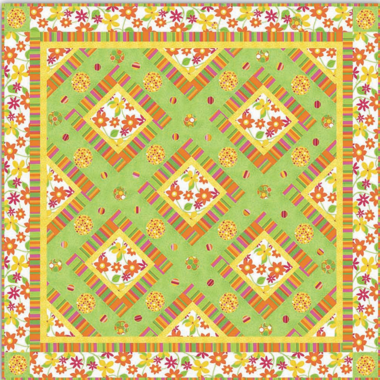
Quilt Size 60 " Square