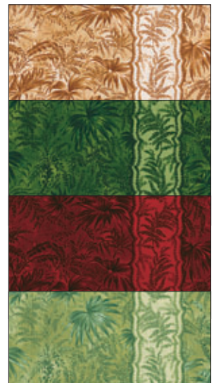
AES-5480-1 NATURAL AES-5480-2 PALM AES-5480-3 CRIMSON AES-5480-7 LEAF