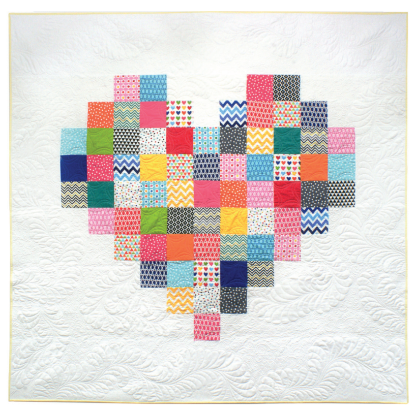
Finished quilt measures 75" x 75"