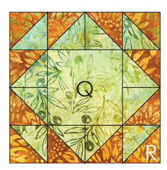
two Q/R Blocks with Fabric Q centers