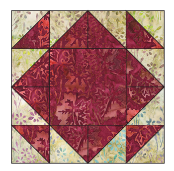
Step 4: Sew the HSTs to the left and right of the center square together to form pairs. Press.

Arrange the units as shown. Note the fabric placement and block orientation in the Block Assembly Diagram.