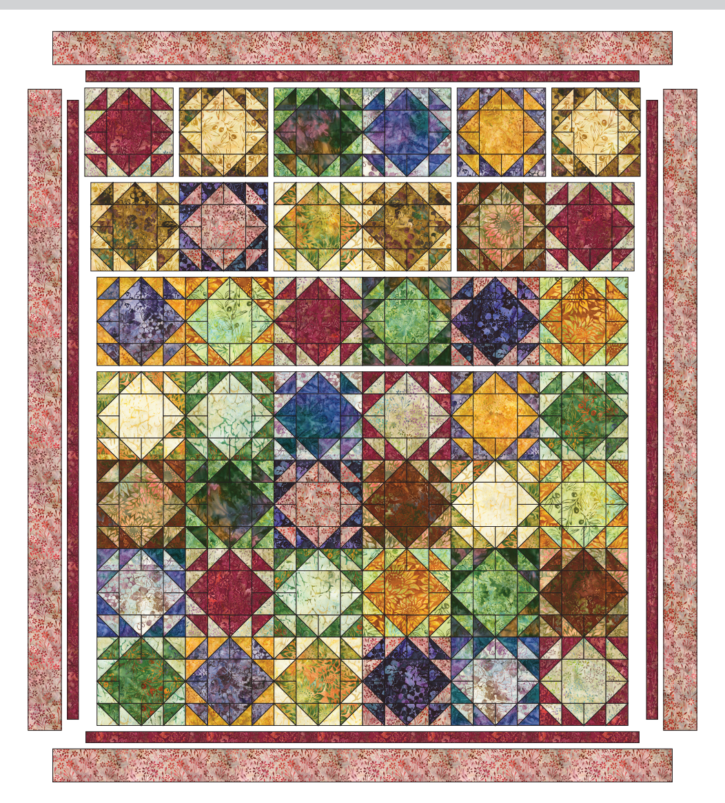
Step 9: Arrange the blocks into seven rows of six blocks. Note the fabric placement and block orientation in the Quilt Assembly Diagram.