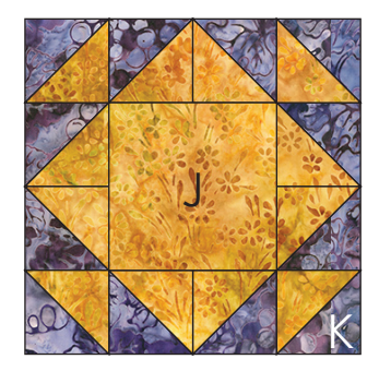
two J/K Blocks with Fabric J centers