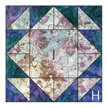
two H/I Blocks with Fabric I centers