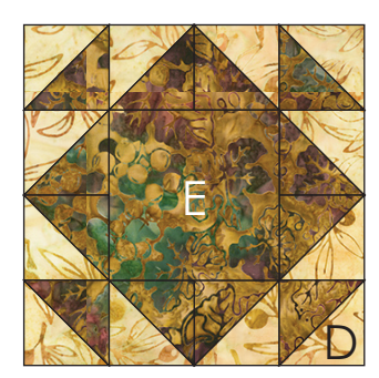
two D/E Blocks with Fabric E centers