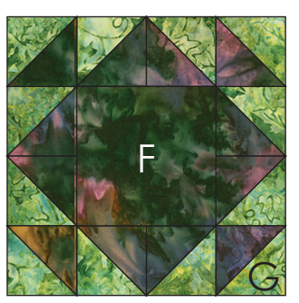
two F/G Blocks with Fabric F centers