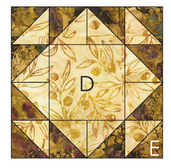
two D/E Blocks with Fabric D centers