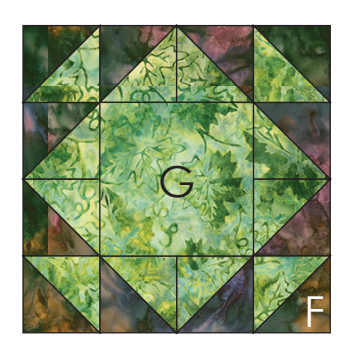
two F/G Blocks with Fabric G centers