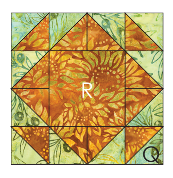
two Q/R Blocks with Fabric R centers