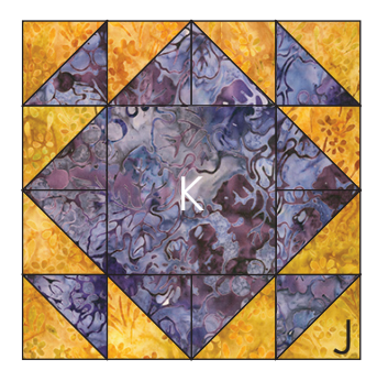
two J/K Blocks with Fabric K centers