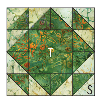
two S/T Blocks with Fabric T centers