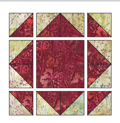
Step 3: Gather: one 4-1/2" Fabric A square twelve A/C HSTs

Arrange the units as shown. Note the fabric placement and block orientation in the Block Assembly Diagram.