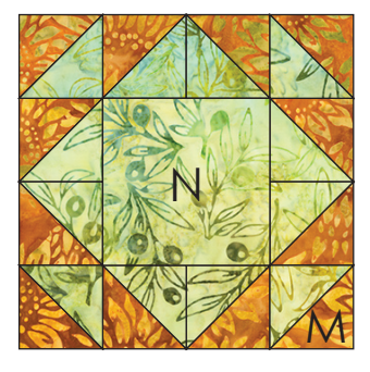
two M/N Blocks with Fabric N centers