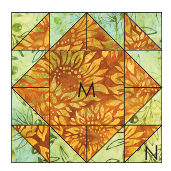
two M/N Blocks with Fabric M centers