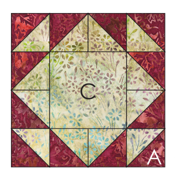
two A/C Blocks with Fabric C centers