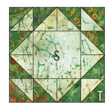
two S/T Blocks with Fabric S centers