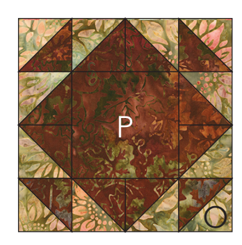
two O/P Blocks with Fabric P centers