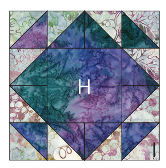
two H/I Blocks with Fabric H centers