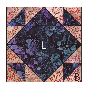
two B/L Blocks with Fabric L centers