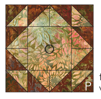
two O/P Blocks with Fabric O centers