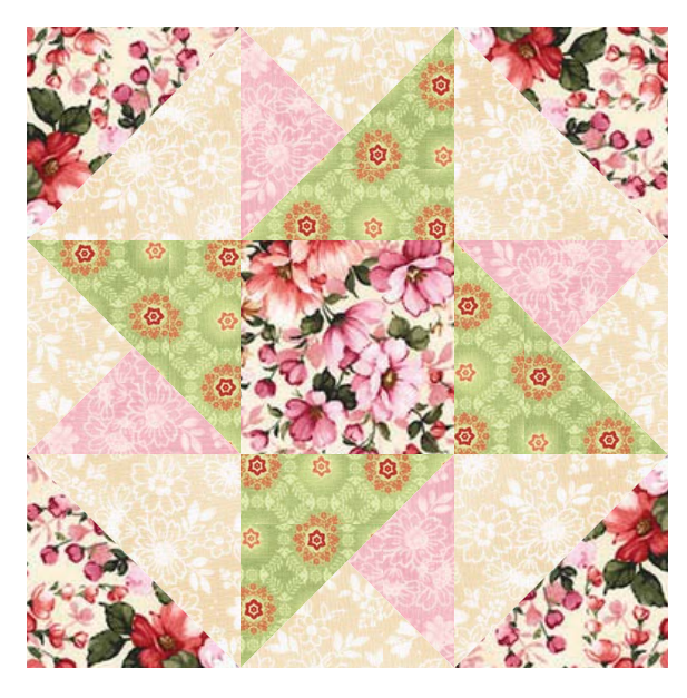
Step 11: Gather four D/I HSTs, four completed Step 10 units and one 3-1/2" Fabric D square. Arrange the units into three rows of three blocks. Note the fabric placement and orientation in the Block Assembly Diagram.

Step 12: Sew the blocks together to form rows. Press the seams away from the Step 10 units.