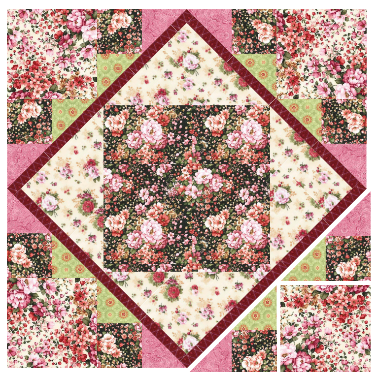
Step 5: Sew one completed Step 4 unit to each of the sides of the quilt center. Press the seams toward the quilt center.