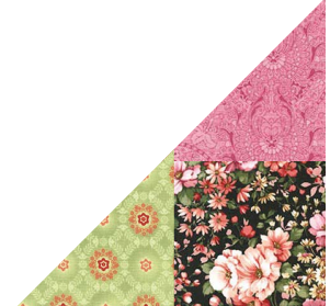
Step 4 : Sew one of each type of unit from Step 3 to two adjacent sides of a 9-1/2" Fabric D square. Press the seams toward the square. Repeat to make four.