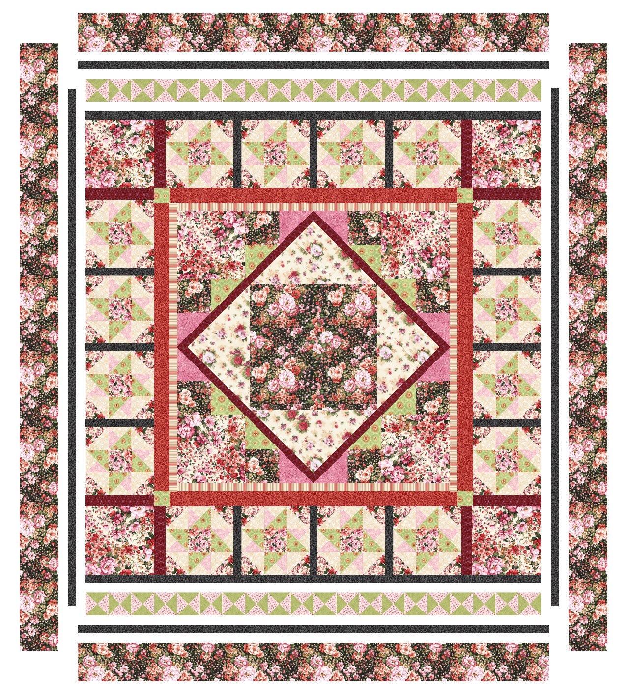
Step 21: Sew completed QST row to the top and bottom of the quilt center. Press toward the Fabric K strip.

Step 22: Sew one 1-1/2" x 68-1/2" Fabric K strip to the sides of the quilt center. Press toward the strip.