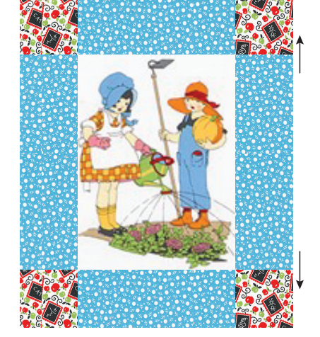
Step 4 Sew a different 2-1/2" x 6-3/4" sashing and contrasting 2-1/2" squares to the top and bottom of the completed large blocks. Press.