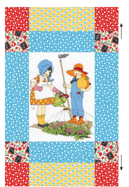
Step 3 Sew the Step 2 units to the Step 1 units, pressing the seams toward the shorter sashings. Repeat for the second large block.