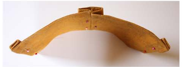
Top view of pleats.