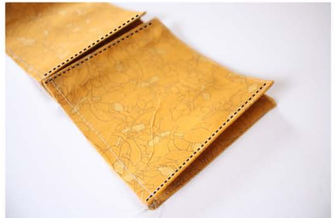
Edgestitching on pleats.