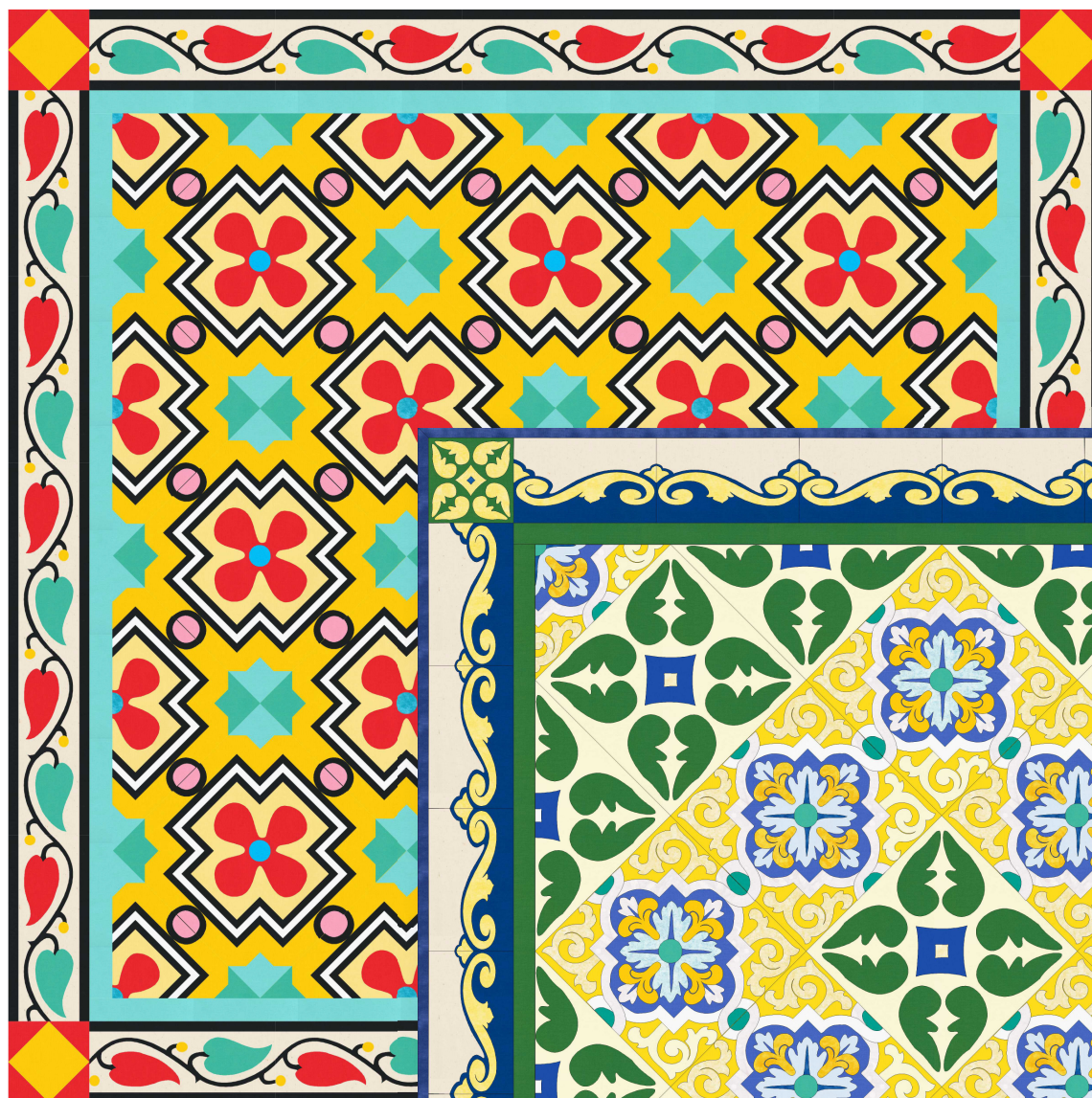
Chili Peppers 50" x 50"