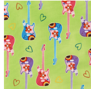
ESK-8104-50 Lime 1½ yards

View A shown here. Fabric requirements listed are for size 6. See chart below for alternate size requirements.