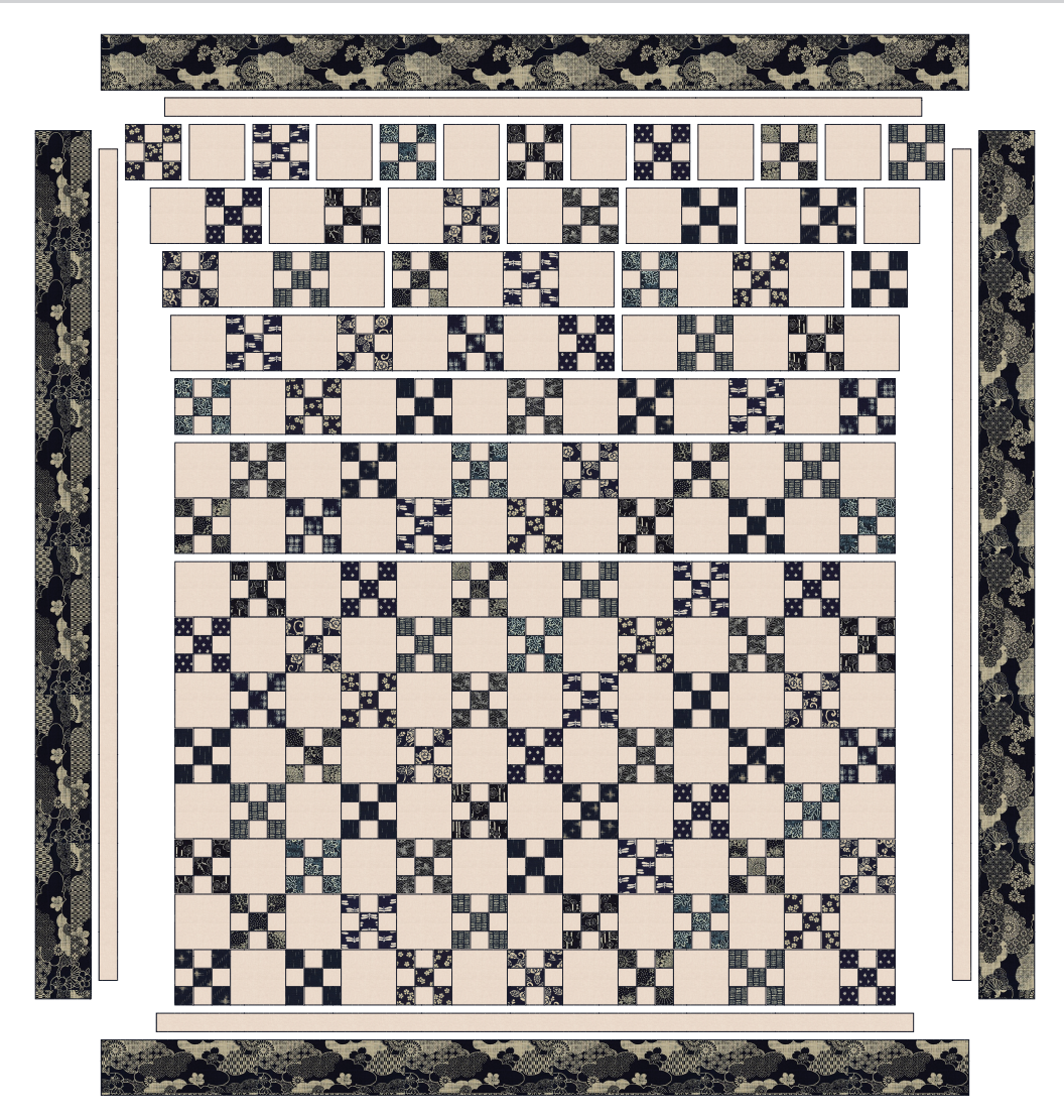
Step 5: Arrange the Fabric A squares and nine-patch Blocks into fifteen rows of thirteen blocks. Follow the fabric placement and block orientation in the Quilt Assembly Diagram, or arrange the nine-patch blocks in a random arrangement of your choosing.