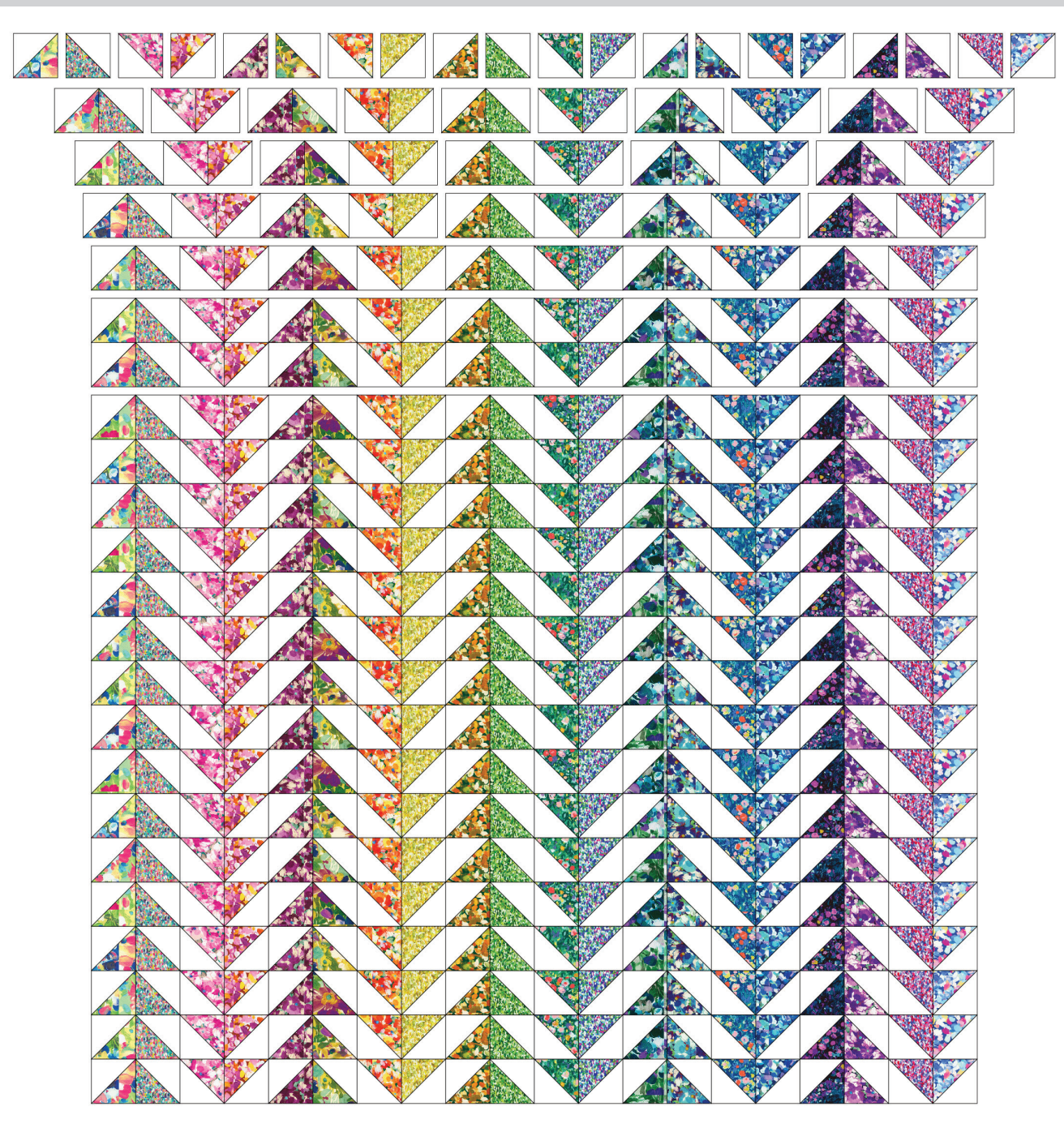
Step 3: Arrange the blocks into twenty-three rows of twenty blocks. Note the fabric placement and block orientation in the Quilt Assembly Diagram.

Step 4: Sew the blocks together to form rows. Press the rows to the left in the odd numbered rows and to the right in the even numbered rows.